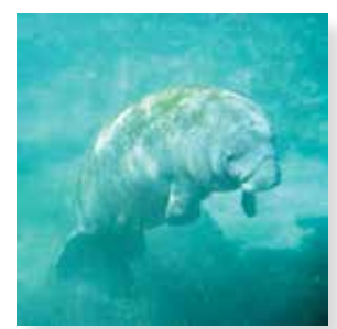
Since 1987, the SWIM Program has funded numerous restoration projects and diagnostic studies to improve habitat for bay life.

Currently, the District's 12 priority water bodies include Tampa Bay, Rainbow River, Crystal River/Kings Bay, Lake Panasoffkee, Charlotte Harbor, Lake Tarpon, Lake Thonotosassa, Winter Haven Chain of Lakes, Sarasota Bay,