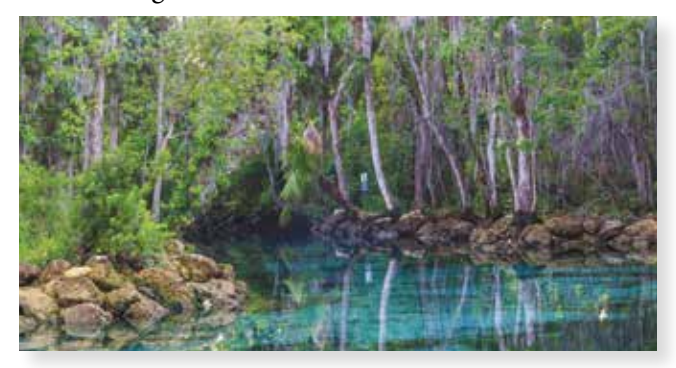
The Three Sisters Springs Bank Stabilization Project repaired the shoreline around Three Sisters Springs to prevent future erosion. These improvements benefit the Crystal River/Kings Bay spring system by restoring habitat including critical manatee habitat, and increasing safety for visitors.

An increase in seagrass acreage is one indicator that water quality is improving in coastal systems, since seagrass requires relatively clean water to flourish. Not only do seagrass beds serve as nurseries for sea life, they also provide protection from predators and a food source for animals such as manatees and sea turtles. The improvement and protection of valuable seagrass habitats are an important aspect of the SWIM Program.