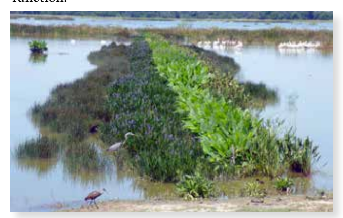
The Lake Hancock Outfall Treatment Wetland Project involved constructing a 1,000-acre treatment wetland to improve water quality leaving the lake before it enters the Peace River. In 2014, more than 100 species of birds were documented at this site.

Habitat restoration projects rebuild the natural structures of ecosystems essential to productive plant and animal communities. Individual mangrove, marsh and seagrass habitats within an ecosystem provide shelter and food for fish and wildlife. Additionally, water quality in these habitats is maintained as aquatic vegetation filters excess nutrients and sediments from the water and holds sediments in place, preventing erosion. Human activities sometimes alter the historical way habitats function.