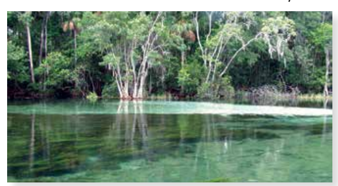
The District conducts water quality monitoring and vegetative studies in the Rainbow River to maintain the quality of the water body.

A main issue affecting water quality is pollution. Water bodies are polluted both directly and indirectly. Some direct pollution sources are easy to identify and manage, such as trash entering lakes, rivers and springs. When water bodies are polluted indirectly by sources such as chemicals in stormwater runoff, the sources are more difficult to identify.